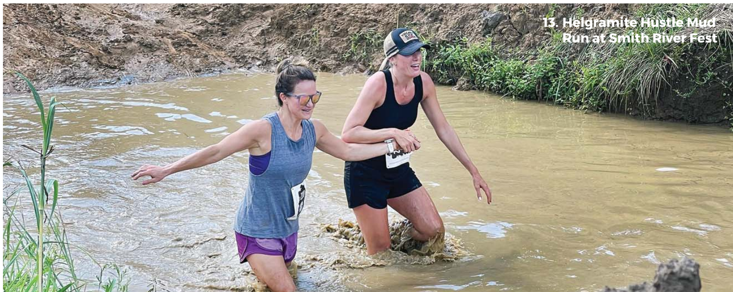
13. Helgramite Hustle Mud Run at Smith River Fest

525 Airport Rd., Martinsville (276) 957-1142