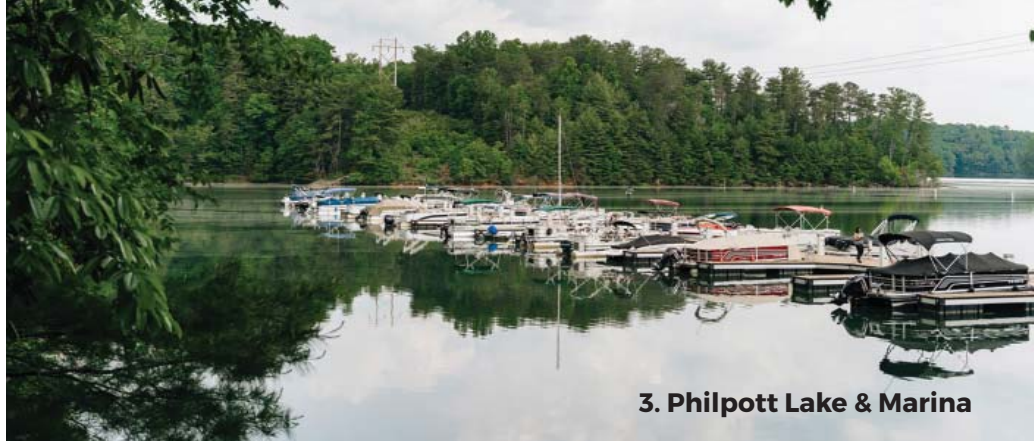
3. Philpott Lake & Marina

300 Boat Dock Rd., Bassett (276) 340-0485