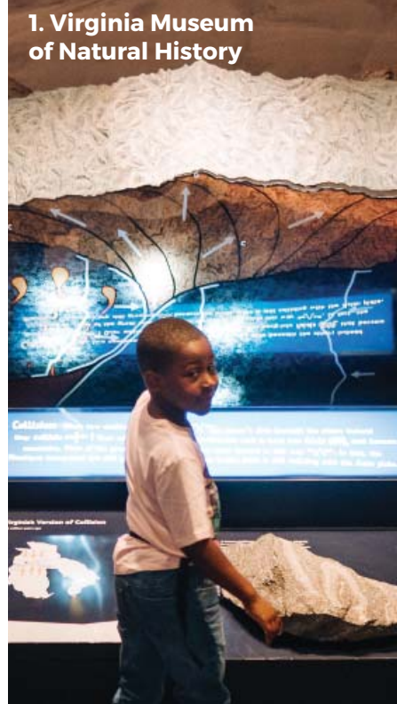
1. Virginia Museum of Natural History