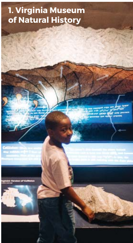
1. Virginia Museum of Natural History

Sip award-winning wines and locally distilled brandy. Hamlet Vineyards 405 Riverside Dr., Bassett (276) 629-2121 Smith River Spirits 1317 Eggleston Falls Rd., Ridgeway (888) 215-0607