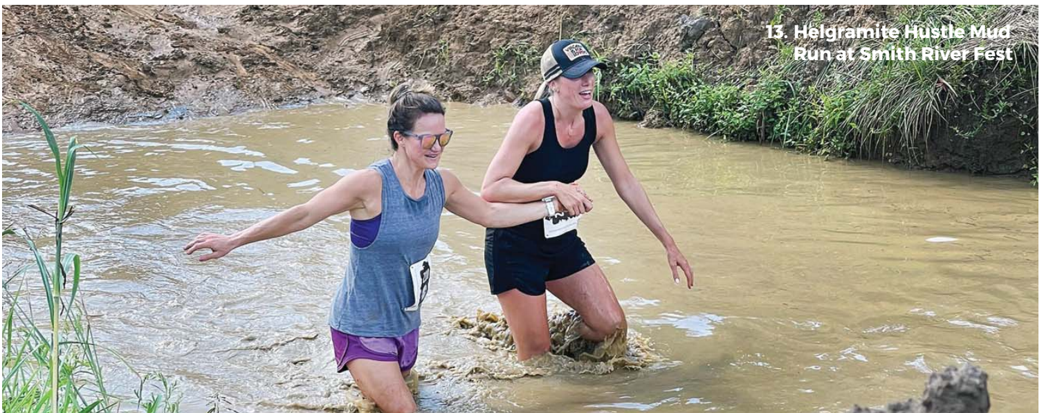
13. Helgramite Hustle Mud Run at Smith River Fest

525 Airport Rd., Martinsville (276) 957-1142